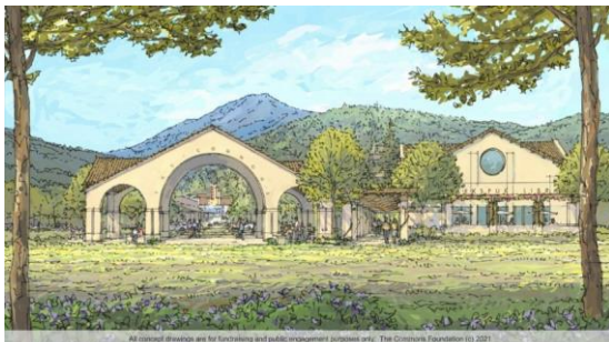
The Larkspur Library Foundation is providing a $100,000 challenge grant to help raise funds for the new Larkspur Library

Larkspur, Calif. (January 14, 2022) – The Commons Foundation (TCF) and the Larkspur Library Foundation jointly announced a $100,000 matching grant from the Library Foundation for cash donations to TCF's Capital Campaign to build the new Larkspur Library. Gifts will qualify for the Library Foundation match if they are in cash, between $1,000 to $49,999, and received by TCF by February 28, 2022.